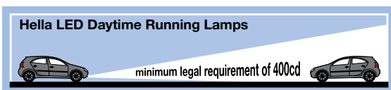
LED Daytime Running Lamps designed as a forward facing signal lamp to enhance the visibility of a vehicle during daylight hours, provides a minimum legal 400cd.